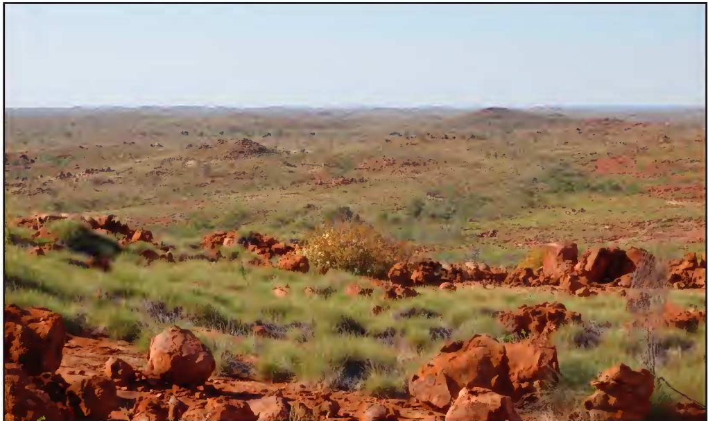
Figure 3. Cochlospermum macnamarae growing in shallow, stony soil closely underlain by granitic bedrock.